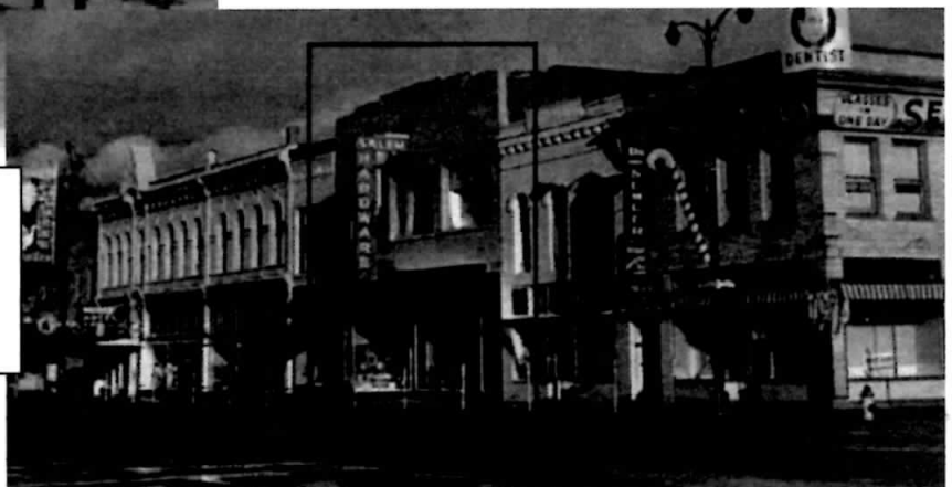
c1950 REFERENCE ONLY WHC, 2007.001.0994 (after c1950 remodel)