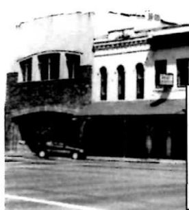
c2000 REFERENCE ONLY (after 1993 remodel)

Key: DCJ: Daily Capital Journal BM: Ben Maxwell Collection, Salem Public Library WHC: Willamette Heritage Center